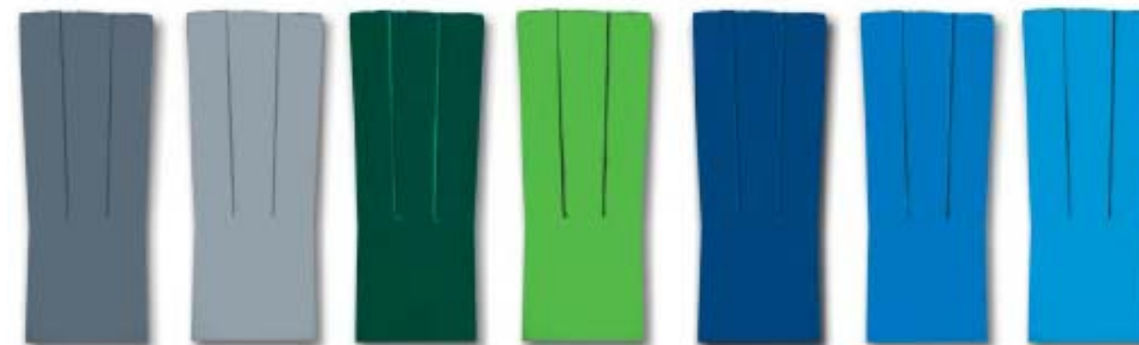
GRAY SILVER GREEN LIGHT GREEN DARK BLUE BLUE LIGHT BLUE